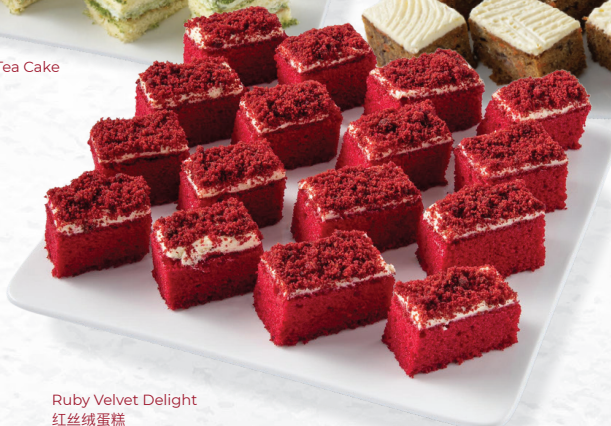
Ruby Velvet Delight 红丝绒蛋糕

SP01 Carot Heaven Square RM7 -Carrot Cake 胡萝卜方块蛋糕