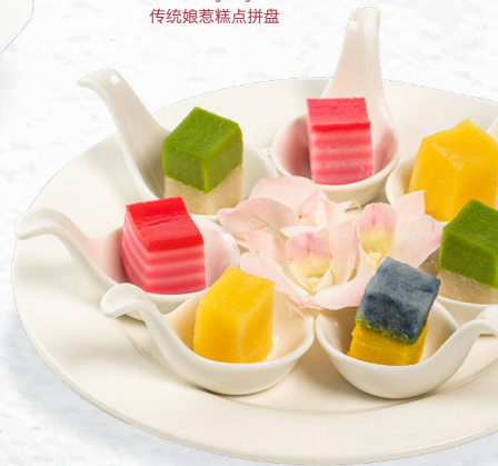
Traditional Nyonya Delights -Local Nyonya Kuih Combination 传统娘惹糕点拼盘