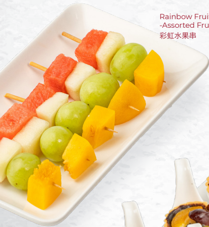
Rainbow Fruit Spears -Assorted Fruit Skewers 彩虹水果串