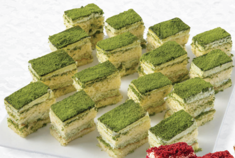
Zen Green Tea Cake 抹茶蛋糕