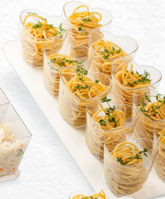
Spaghetti al Aglio e Olio -Aglio Olio Spaghetti 蒜香意大利面