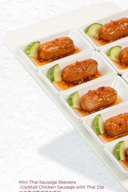
Mini Thai Sausage Skewers -Cocktail Chicken Sausage with Thai Dip 迷你泰式蘸酱鸡肉香肠