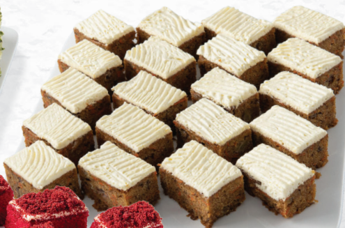
Carrot Heaven Square 胡萝卜方块蛋糕