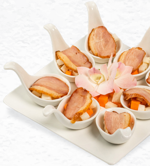
Smokey Duck and Greens -Smoked Duck Slices with Salad 烟熏鸭片配沙拉