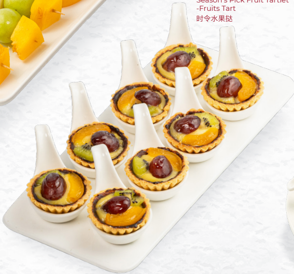
Season's Pick Fruit Tartlet -Fruits Tart 时令水果挞